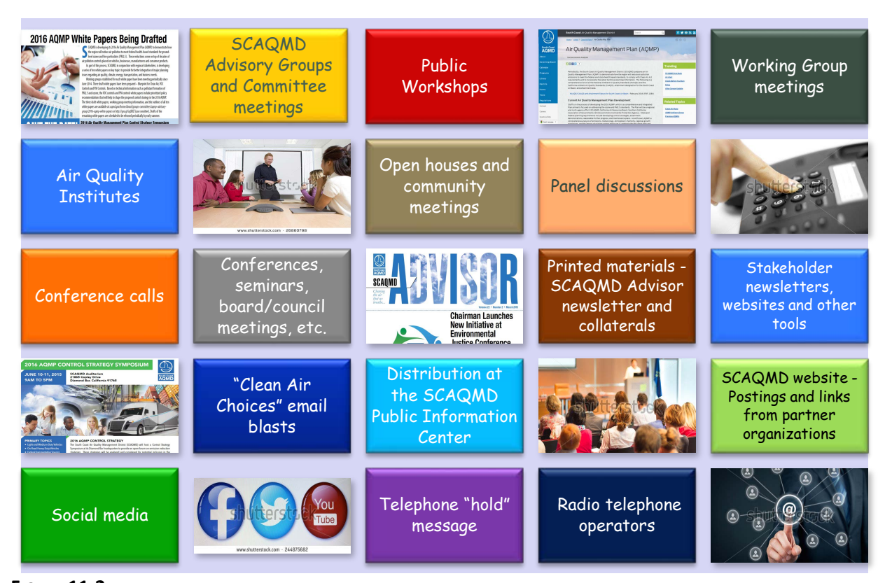
FIGURE 11-2 FORMATS AND COMMUNICATION OUTREACH METHODS USED FOR THE 2016 AQMP