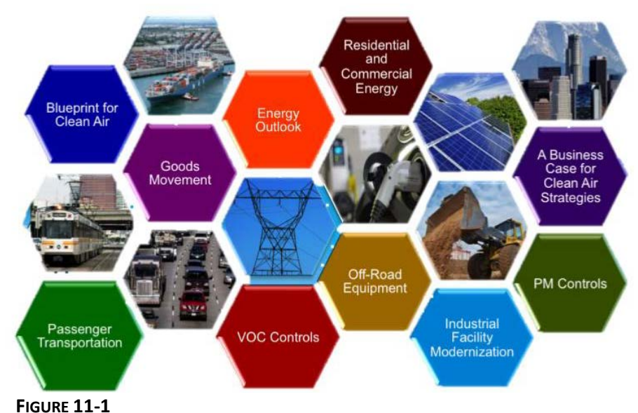
2016 AQMP WHITE PAPERS

Leading up to the development of the 2016 AQMP, SCAQMD staff in conjunction with stakeholders prepared 10 white papers on key topics to provide technical background, a policy framework for the AQMP, and better integration of major planning issues such as air quality, transportation, climate, energy, and business considerations.